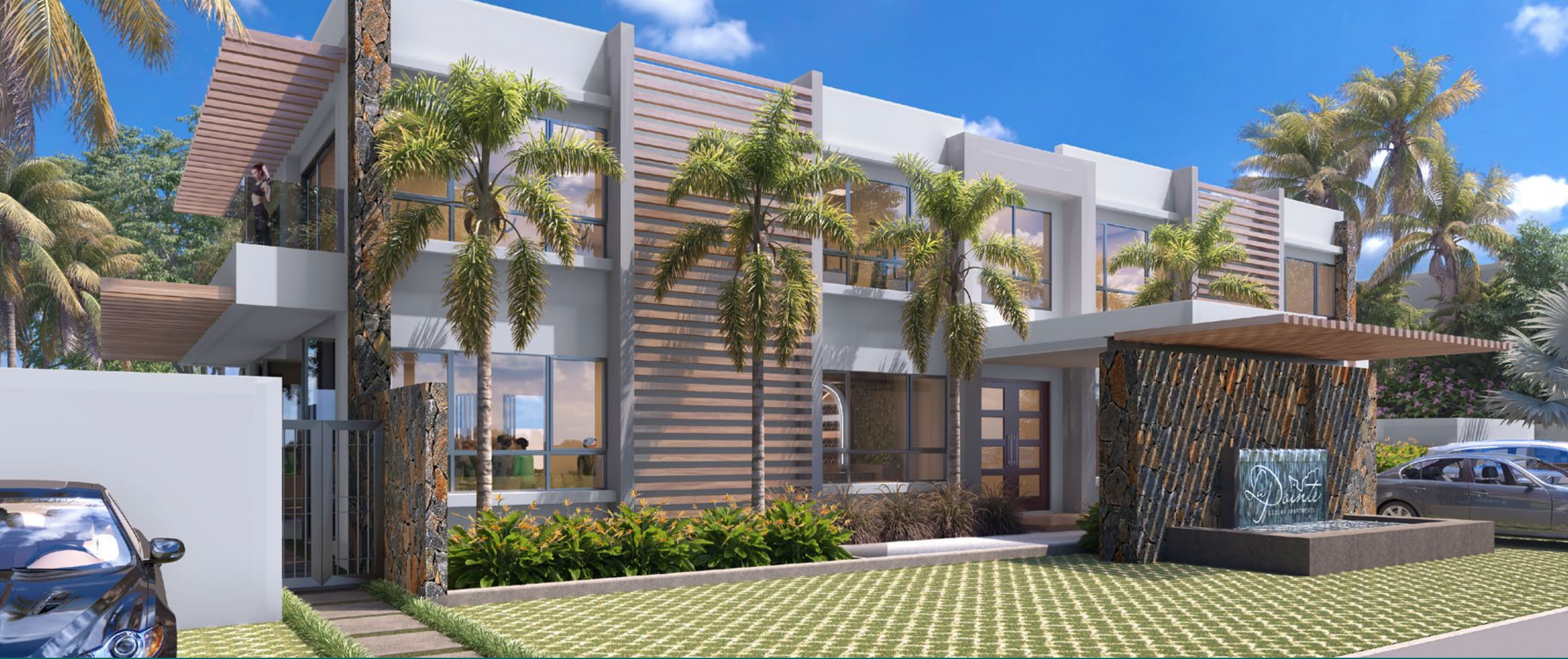
Club House Entrance