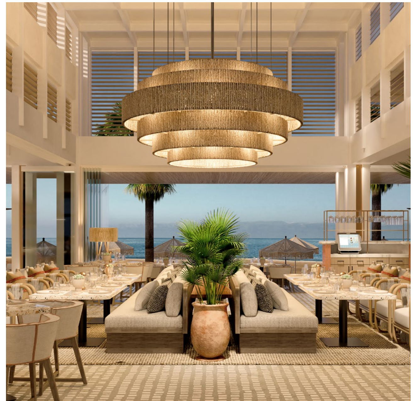
The Beach Club Restaurant

After a day spent unwinding by the pool, share a joy-filled meal with friends and family at the Beach Club Restaurant, where sun-kissed Mediterranean flavours, a breezy coastal aesthetic, and enchanting Indian Ocean views create a cocoon of comfort on the edge of the sand.