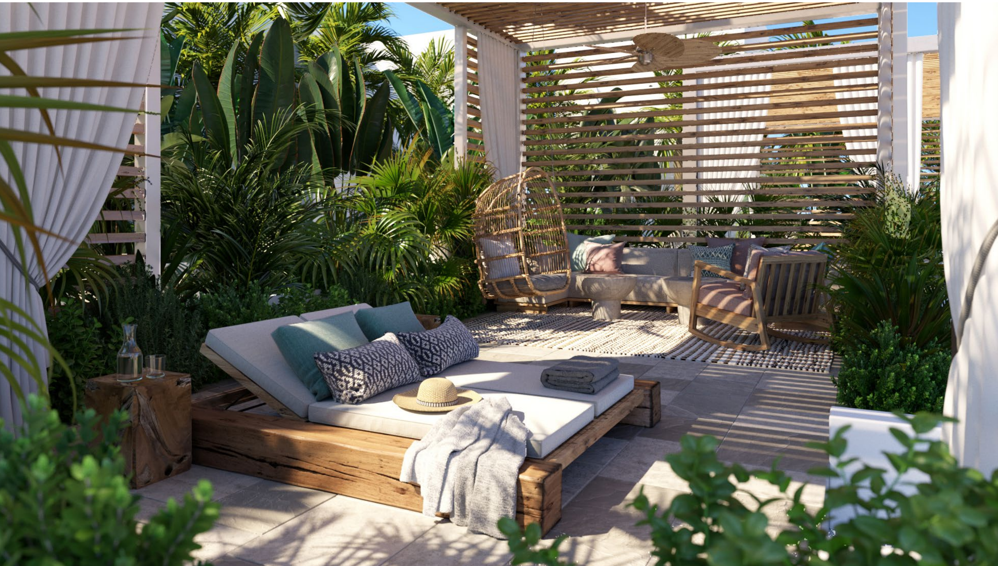
Family Pool Cabana

The beating heart of the estate, the Beach Club invites residents to relax and reconnect in exquisite surroundings. With cushioned daybeds, coastal-chic furnishings and cooling overhead fans, the private poolside cabanas will feel like a natural extension of your home.