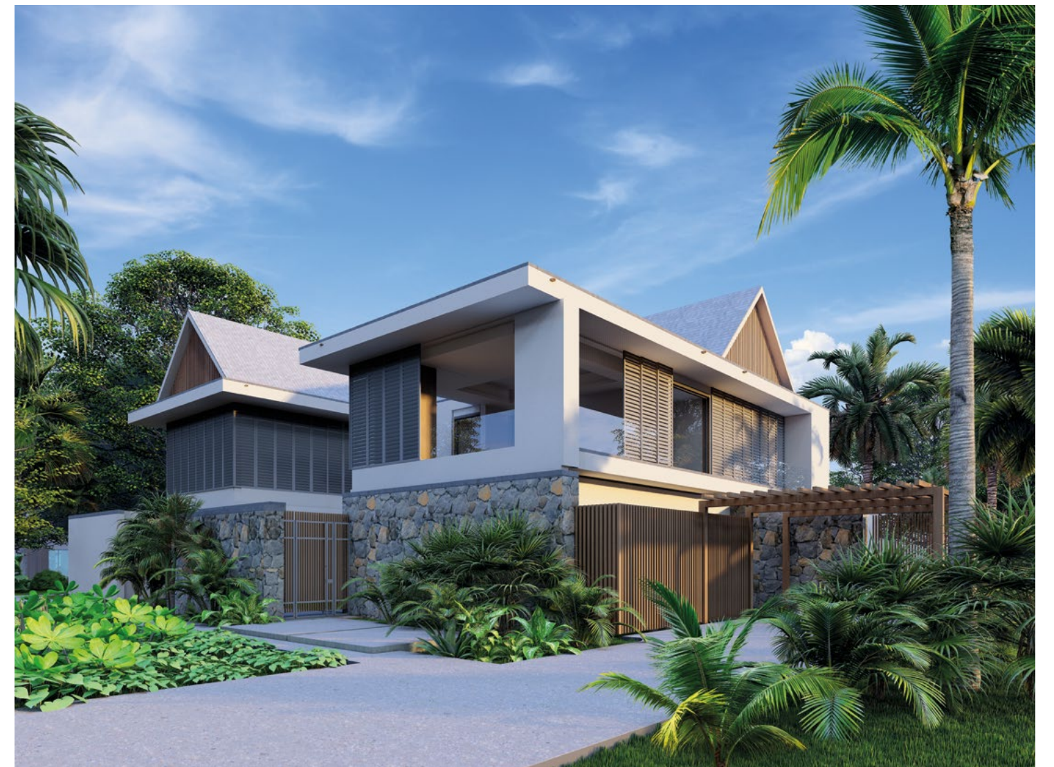
Entrance to 4-Bedroom Botanical Villa

Escape to your private tropical oasis with our exclusive Botanical Villas. Set amid lush gardens on expansive plots of land, these secluded retreats invite you to relax and unwind amid the natural beauty of Mauritius.