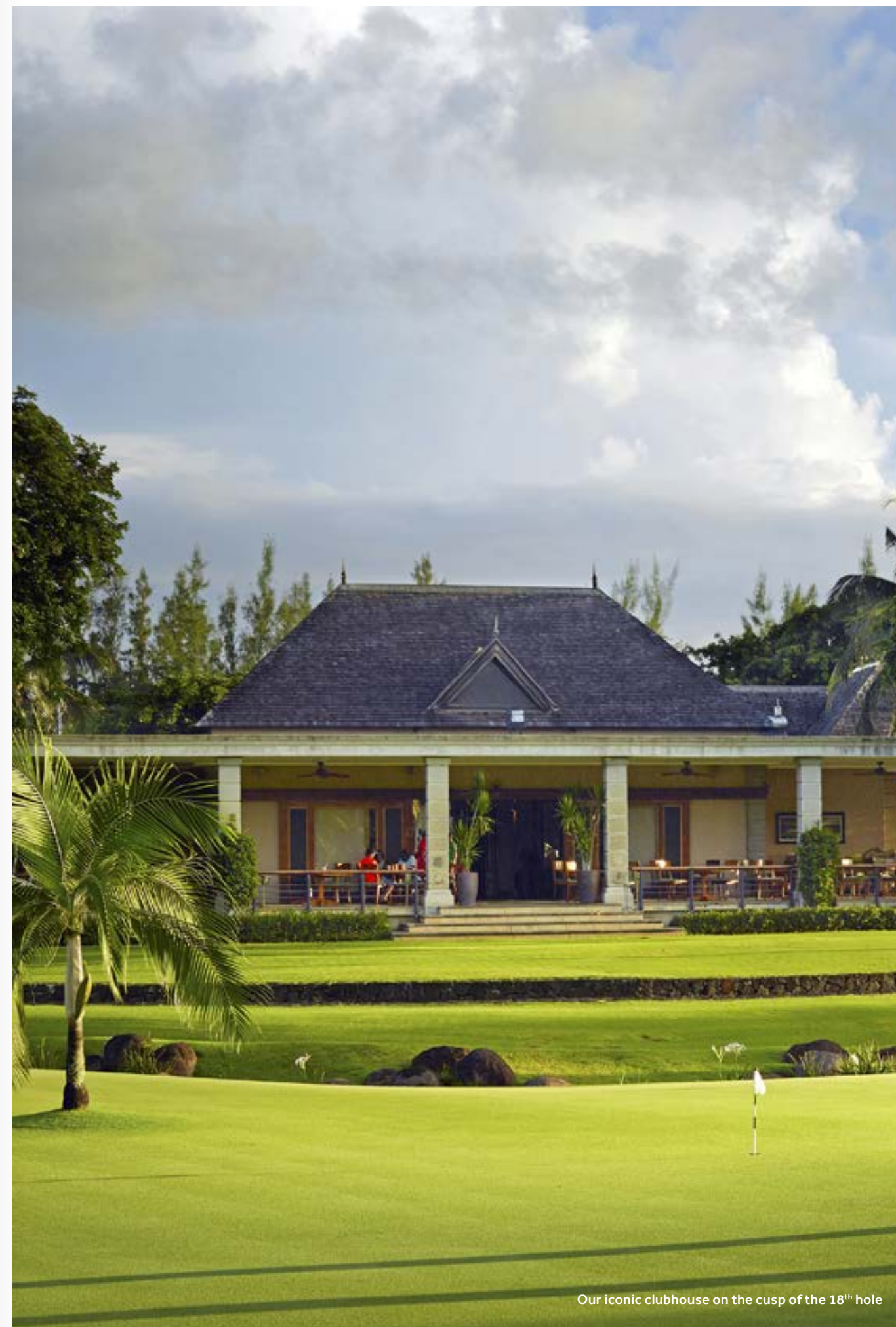
Our iconic clubhouse on the cusp of the 18 th hole